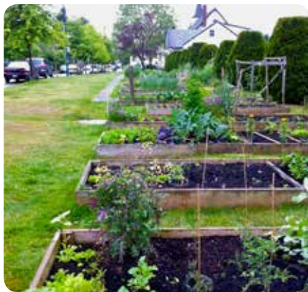
Garden Of Eatin' Feeds The Hungry - page 12