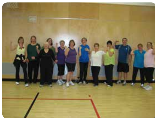
Healthiest Winners in KCC - page 19