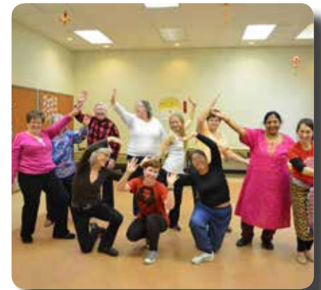
Community Flashmob - page 8